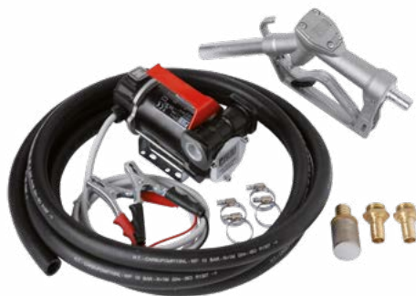
BATTERY KIT 3000 INLINE