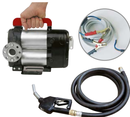
BATTERY KIT BIPUMP