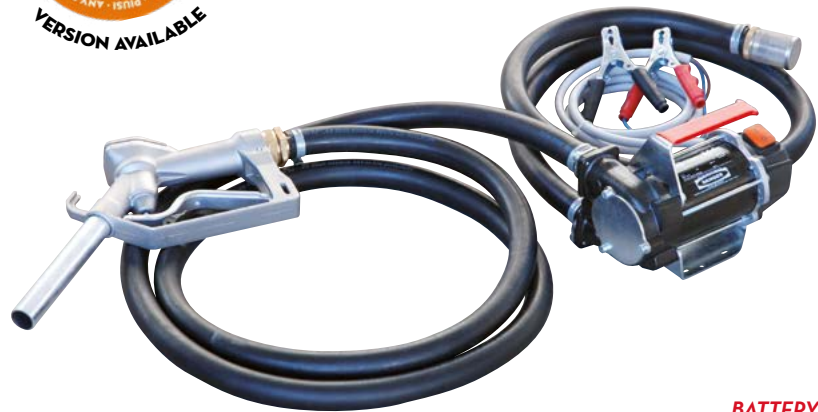
BATTERY KIT 3000